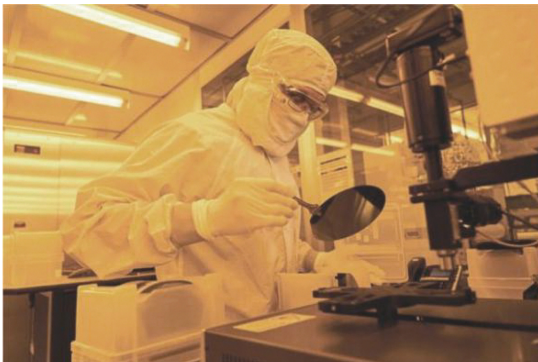
A Rigetti employee inspects a silicon wafer with superconducting quantum integrated circuits that was fabricated at Rigetti's Fab-1 facility.

Rigetti Foundry Services leverages the company's US-based in-house fabrication facility to deliver superconducting quantum chips to advance and accelerate quantum information science and technology research and development efforts. Customers include researchers spanning academia, defense laboratories, and national laboratories.